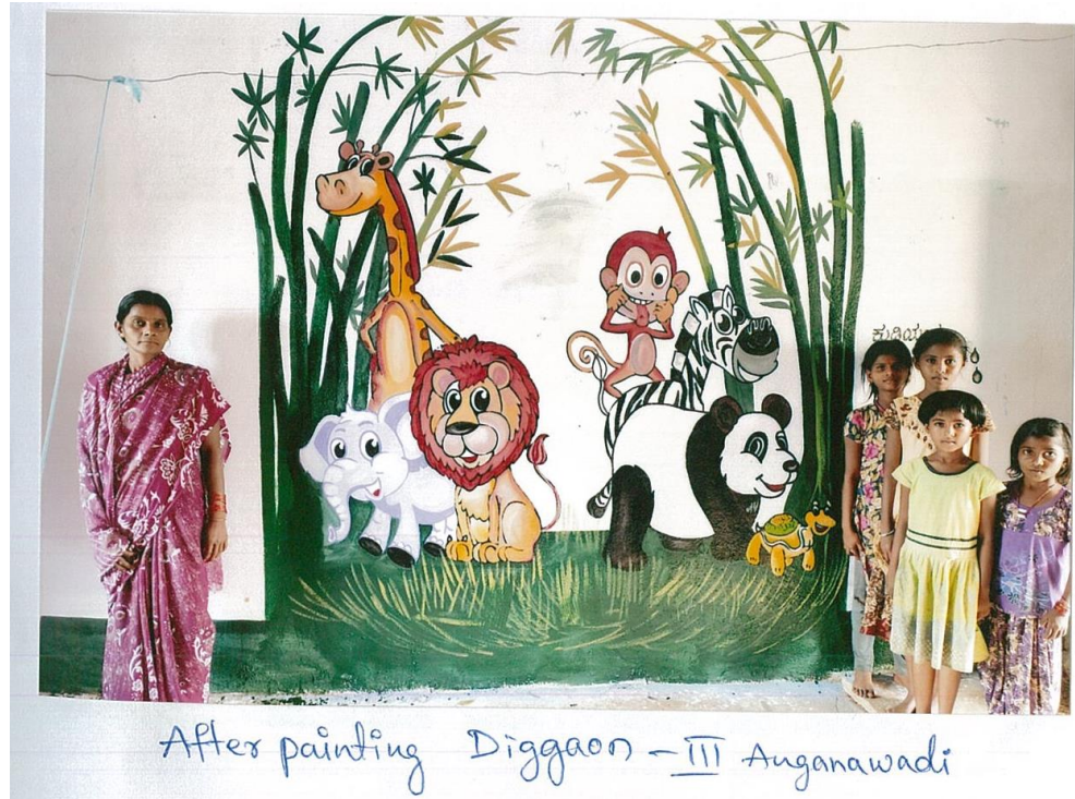
After painting Diggaon - III Anganawadi